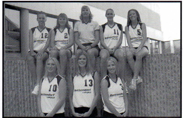
Volleyball Returning Letterwinners