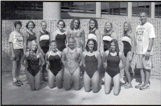
Swimming Returning Letterwinners