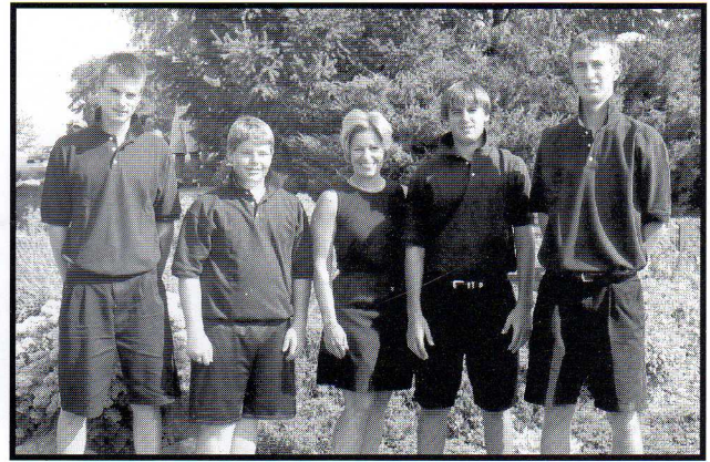
Golf Returning Letterman