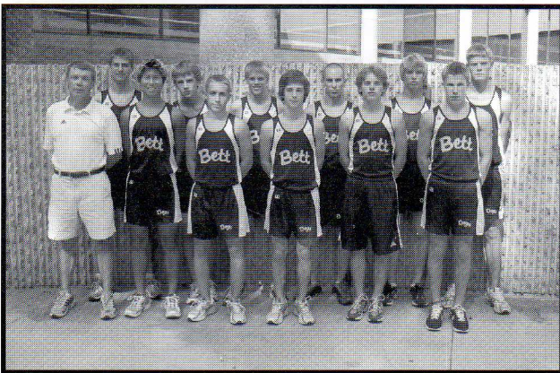
Cross Country Returning Letterwinners